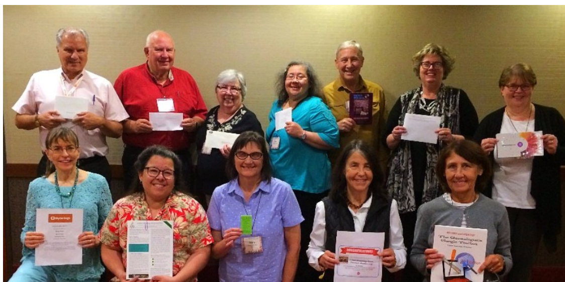
Door prize winners at the 2017 FEEFHS Conference banquet.